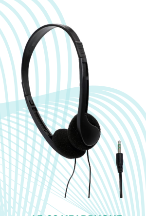
AE-08 HEADPHONE A time-honored favorite

With simple solutions that provide quality with value, you can offer thoughtful audio touchpoints and accessories that keep the people you serve listening and connected everywhere they go on their life-long learning journey.